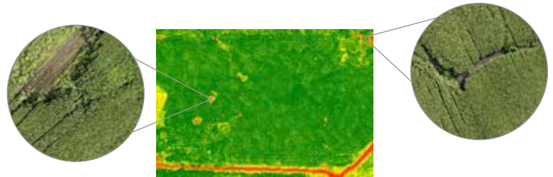
NDVI QuickTile Image

Review the QuickTile image on-site, and then drill into individual RGB and NDVI photos to assess areas of concern and address in real time.