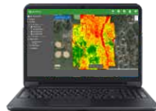
Highly Precise, Actionable Plant Health Data