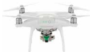
Precision scouting tool