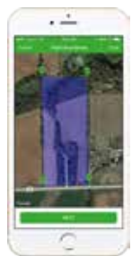
AgVault Mobile App

Sentera's complete solutions enable you to collect and make use of highly precise on-field data in real time. Easily compare, share, and analyze your NDVI plant health data in no time. Creating actionable data has never been easier.