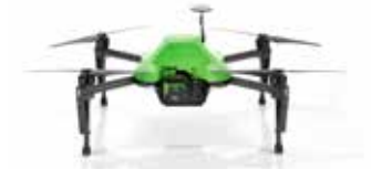
Gimbaled Multispectral Double 4K Sensor on Sentera Omni Drone

Additionally, the Sentera lock-and-go gimbal allows you to simply click the Multispectral Double 4K into a DJI Inspire 1, Inspire 2, Matrice 100 or 200 drones. The gimbal stabilizes the sensor, has a dedicated GPS for geo-tagging data, and can be configured to capture imagery with the your desired level of overlap. No tools or modifications are required for this integration, allowing you to quickly swap between the Multispectral Double 4K sensor and other gimbals, including the X3, XT, and X5.