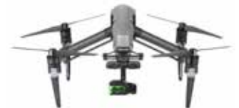
Lock-and-Go Gimbaled Multispectral Double 4K Sensor on DJI Inspire 2 Drone