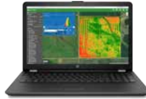
FieldAgent Web App