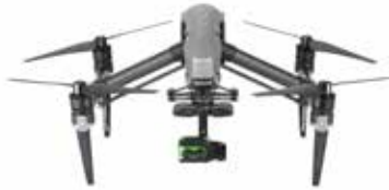
Precision Scouting Tool